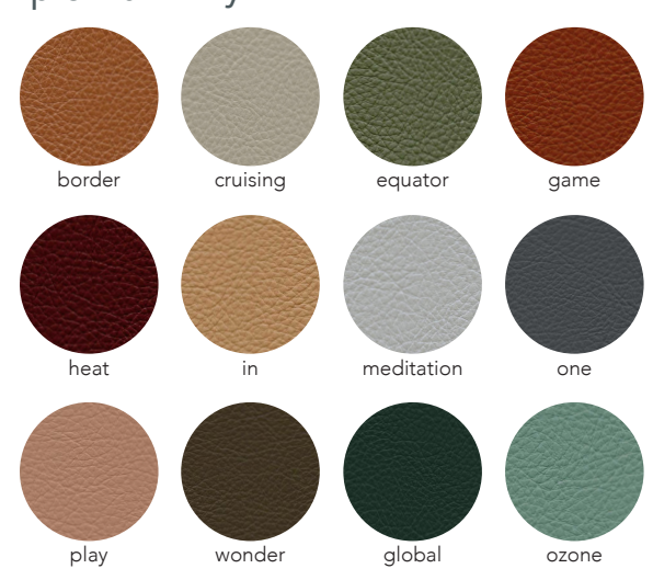
house leather semi analine leather origin: italy